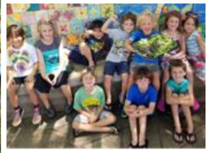
FUN AT KINDERGARTEN AINA!